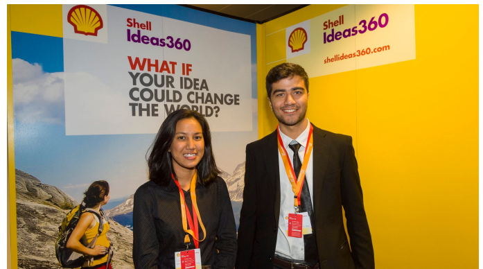
The Cricketeers from Malaysia: