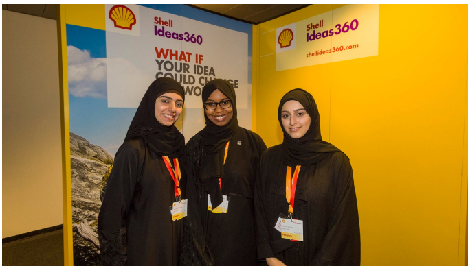
Team Passive from Qatar: